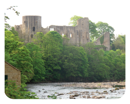
View of Barnard Castle from the River Bank

Follow the path round to the right and cross the first wooden bridge on the left over Percy Beck coming to the open grassy area. This is known as the Band Stand since the time when concerts were held here in Edwardian times. Follow the footpath along the side of the river for about quarter of a mile. The path then splits, but soon joins up again. Take care when it splits a second time and keep to the left, as a steep stone-stepped path up to the right leads to the remains of the Tees Railway Viaduct. This was built in 1861 and carried the line from Barnard Castle to Middleton and Kirby Stephen via Stainmore.